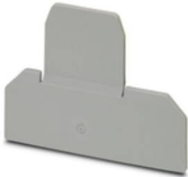
Partition plate, length: 75 mm, width: 2.5 mm, height: 67 mm, color: gray

Please be informed that the data shown in this PDF Document is generated from our Online Catalog. Please find the complete data in the user's documentation. Our General Terms of Use for Downloads are valid ( http://phoenixcontact.com/download )